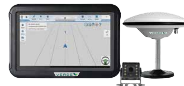
VERDE AP1+Camera (Optional)